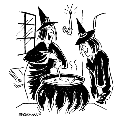
"It's vegetarian vegetable."

And, if you're not well stocked in sundry goodies come this night, you may find "calling cards" decorating your property, both mobile and immobile. So store in a vast supply of sweets and set the chain bolt on your front door. IT'S HALLOWEEN!